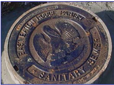
One of the first steps in rehabilitation includes a physical inspection of manholes and pipes to identify blockages.

Rehabilitation of the sewer collection system is a comprehensive physical process that begins with cleaning and inspection of sewer pipes and manholes. Typical rehabilitation repairs include pipe and manhole replacement and trenchless technologies that minimize above ground disturbances, such as cured-in-place pipe liners. Phase A includes open cut repairs and Phase B includes CIPP lining.